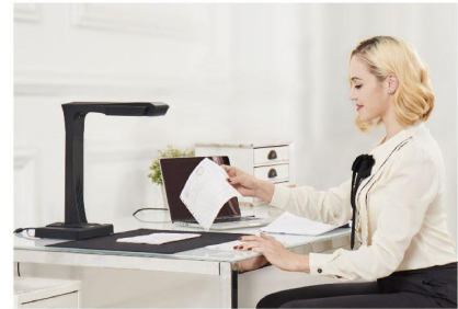
Accounting / Finance