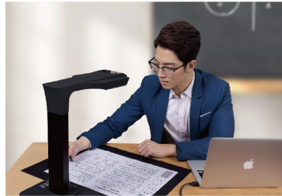
University / School