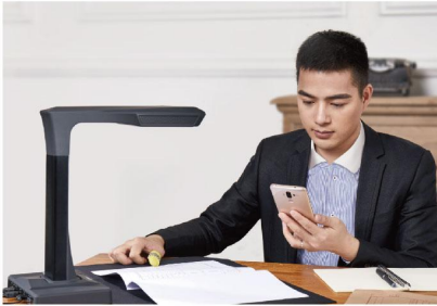
Law / CPA Firm

Scan book, magazine, drawing, picture, blueprint, receipt and so on.